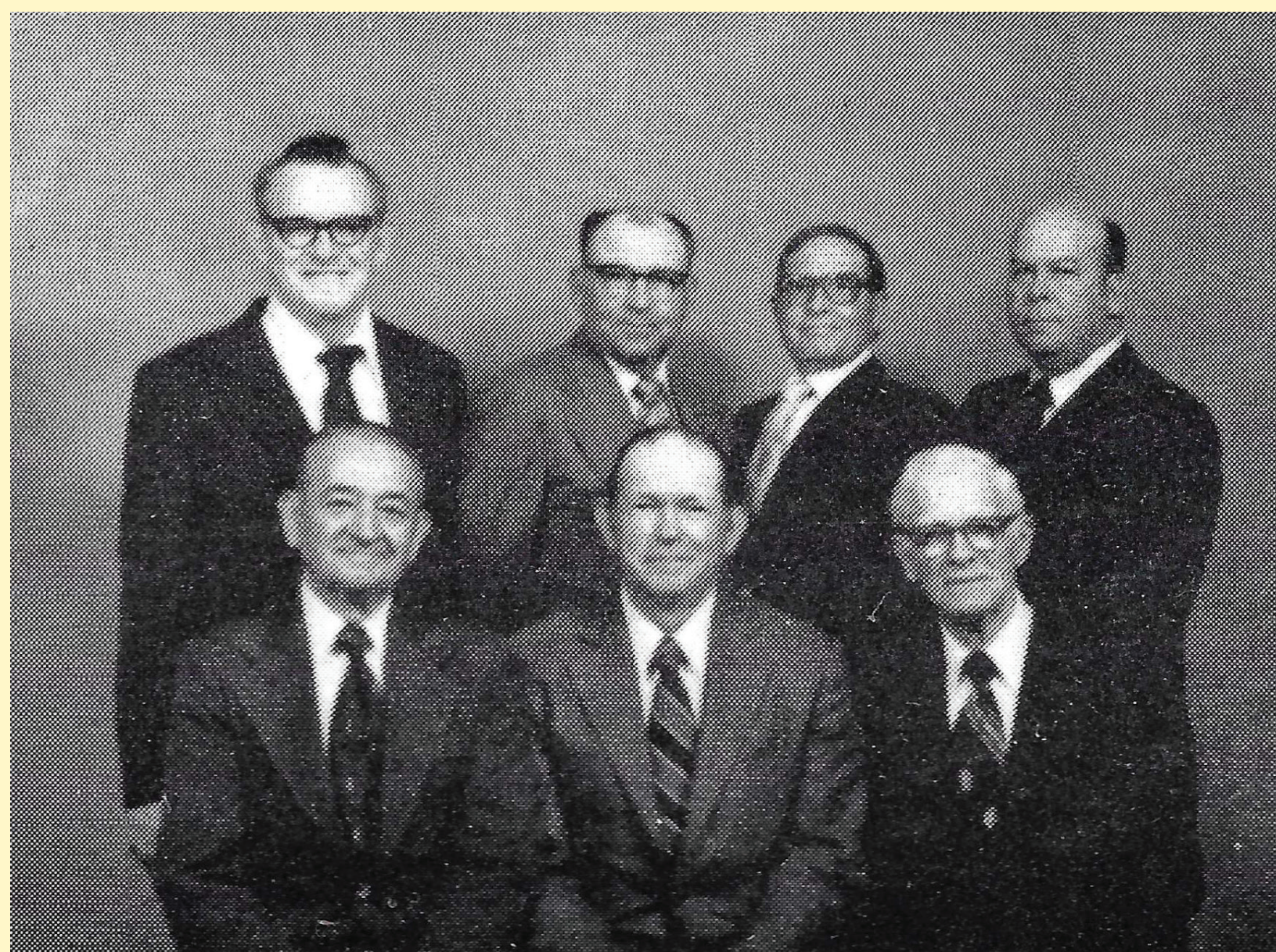
Hickory Withe Church Elders, 1980